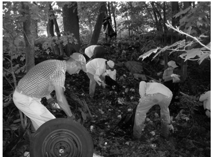
Volunteers hard at work cleaning up one of the seven targeted cleanup sites along the Galien River.

An estimated ten cubic yards of metal, glass, and trash, along with 52 tires were pulled out of seven locations within the Galien Watershed. The areas cleaned, represent approximately 1 mile of stream. The tires were recycled through Berrien County. Disposal services and recycling were contributed by Forest Lawn Landfill, Reliable Disposal, Redbud Recycling, and Weesaw Township.