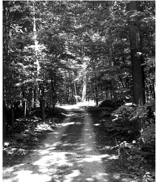
Tucked away in the southern part of Three Oaks Township, this 18 acres of forest land has been preserved by Bob and Vickie Wagner.

As if preserving native forest land, important wildlife habitat and pieces of nature for future generations wasn’t enough, this conservation easement also improves water quality in the Galien River. Though not directly connected, the Property lies between Spring Creek, ½ mile to the north, and an unnamed stream, ¼ mile to the southeast, both tributaries of the Galien River. This conservation easement enhances the ecological value of this corridor in the watershed.