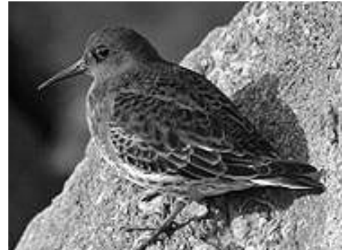
Purple Sandpipers are sometimes found here in the late fall and early winter.

"...an excellent area to watch offshore for migrating waterfowl and shorebirds. The beach area north of the harbor and the sandy areas on both sides of the inner harbor should be checked for resting shorebirds, gulls and terns...scan the rock jetties carefully as Spotted Sandpipers, Ruddy Turnstones and other species often rest or feed here." www.sarett.com/birding.htm