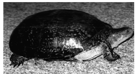
The Blanding's Turtle is threatened by wetland degradation and road mortality and is protected by Michigan law as a special concern species.

Think you have a talent we could use? Call Bev at 269-469-2330 or email Bev@chikamingopenlands.org